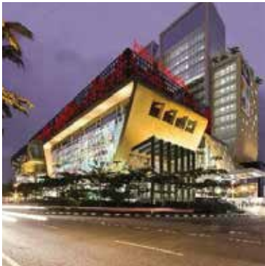
CGV Focal Point

Location: Medan Scope: Mechanical & Electrical Owner: PT. Graha Layar Prima Value: +/- 5 Billion