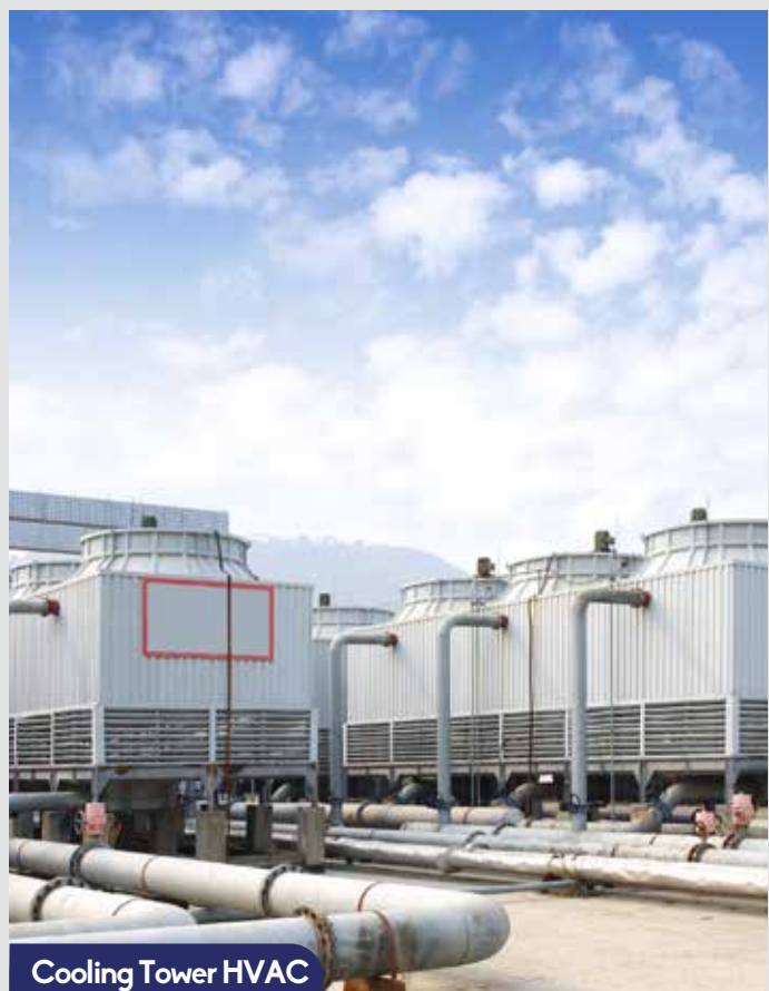
Cooling Tower HVAC