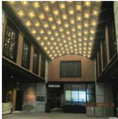
CGV Bella Terra

Location: Medan Scope: Mechanical & Electrical Owner: PT. Graha Layar Prima Value: +/- 5 Billion