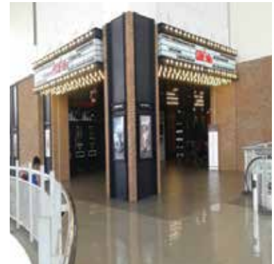
CGV Miko Mall

Location: Jakarta Scope: Mechanical & Electrical Owner: PT. Graha Layar Prima Value: +/- 5 Billion