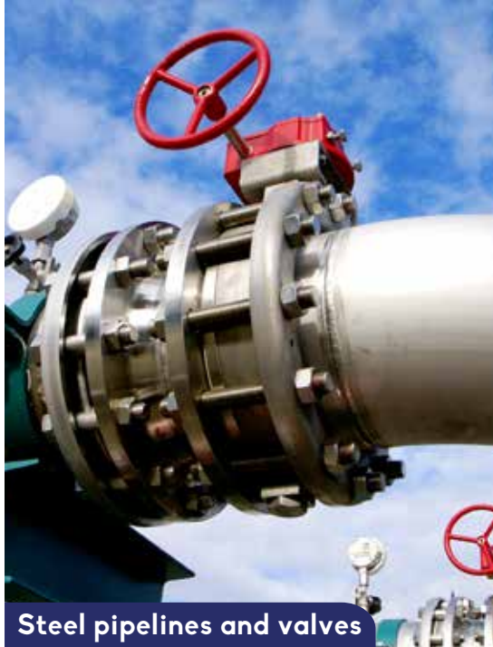
Steel pipelines and valves