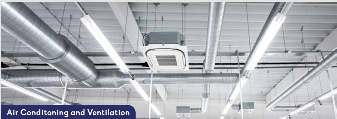
Air Conditioning and Ventilation

Air conditioning and ventilation, fire fighting system, Plumbing, Water Treatment / Sewage treatment plant, Lift and Escalator