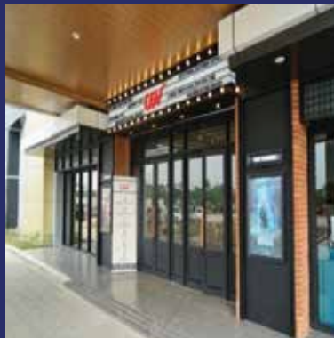
CGV Cinema Batavia

Location: Surabaya Scope: Mechanical & Electrical Owner: PT. Graha Layar Prima Value: +/- 6 Billion