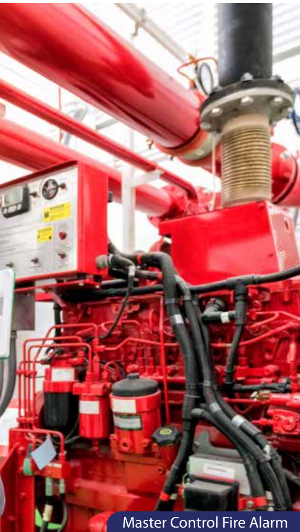
Master Control Fire Alarm