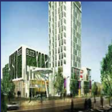
CGV Marvel City

Location: Bandung Scope: Mechanical & Electrical Owner: PT. Graha Layar Prima Value: +/- 4.5 Billion