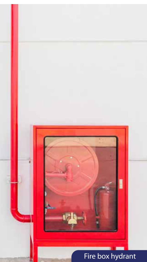
Fire box hydrant