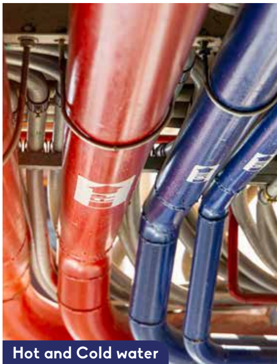
Hot and Cold water

Clean Water System, Sewage Treatment Plant & Grey Water System