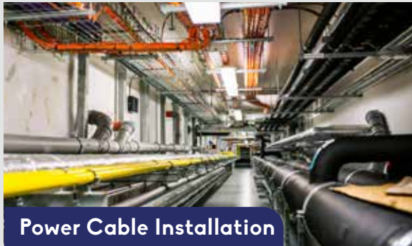
Power Cable Installation