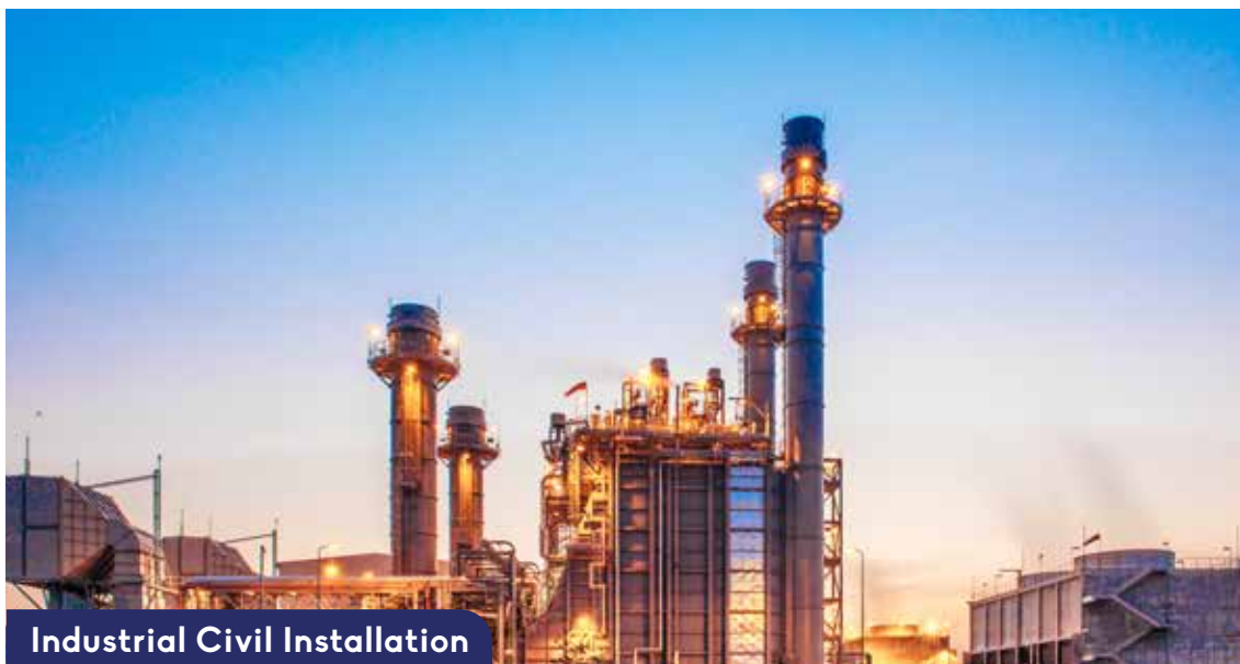
Industrial Civil Installation