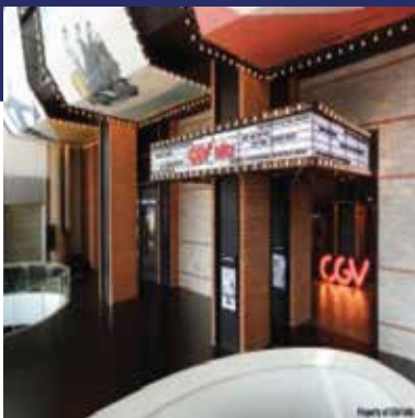
CGV Grand Indonesia

Location: Bandung Scope: Mechanical & Electrical Owner: PT. Graha Layar Prima Value: +/- 4 Billion