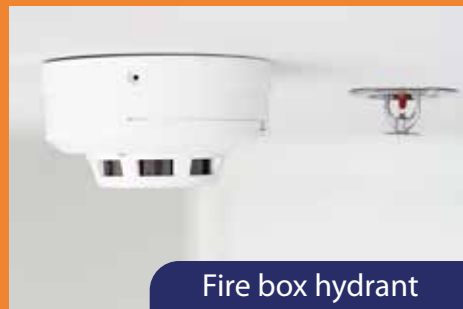
Fire box hydrant