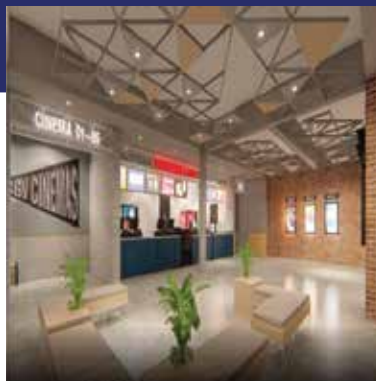
CGV Kediri Mall

Location: Jakarta Scope: Mechanical, Electrical & Plumbing Owner: PT. Graha Layar Prima Value: +/- 3.7 Billion