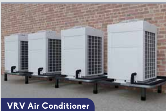
VRV Air Conditioner

Air conditioning and ventilation, fire fighting system, Plumbing, Water Treatment / Sewage treatment plant, Lift and Escalator